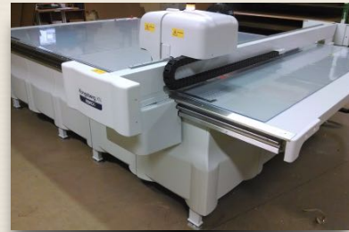
Versatile and Powerful Kongsberg CAD Table

ArtiosCAD: 2D & 3D Packaging Design Software