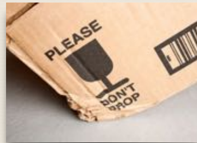
ASTM / ISTA Certified Testing Capabilities

ASTM / ISTA Certified Testing Capabilities: Compression, Drop, Incline, Vibration