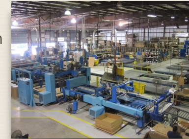
State of the Art Machinery

Polyethylene, Polypropylene, Polystyrene, Polyurethane