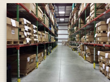
Vendor Managed Inventory